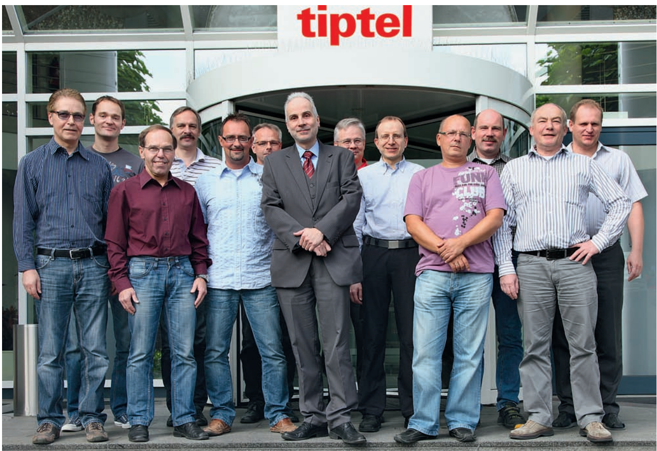
Tiptel's R&D Department in front of Ratingen headquarters. Here the new IP telephone family has been developed. The production takes place in an associated manufacturing company.

The dedicated R&D team of Tiptel.com GmbH Business Solutions stands for technology on the highest level. Together they prove that first-class quality and functionality are realizable in Germany. The team has designed and developed the new premium telephones tiptel 3110, 3120 and 3130, as well as the additional keypad tiptel KM 27 in Ratingen. The devices are also produced in Ratingen by an associated manufacturing company.