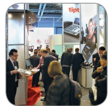
Trade fairs: review