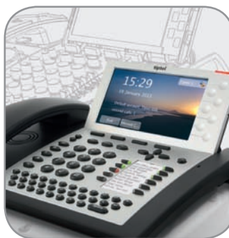
SIP Centrex certification of the new IP telephones