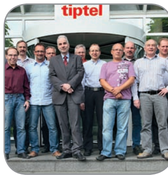
R&D department and production of the new IP telephones 3110 – 3130: high-tech "Made in Germany"